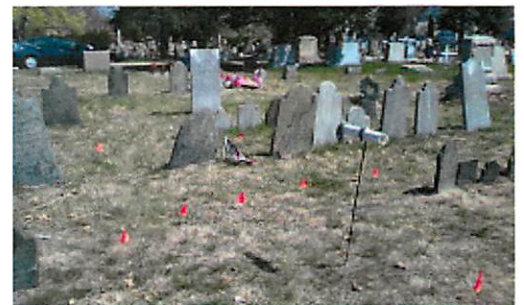
Researching 1700 section @ Oakland / probing vicinity for stones

2. At CR020 – Knightsville Meeting House Lot Note: we went to #20 two times. As of this writing, it is overgrowing again. Poison ivy needs to be addressed & jungle growth.