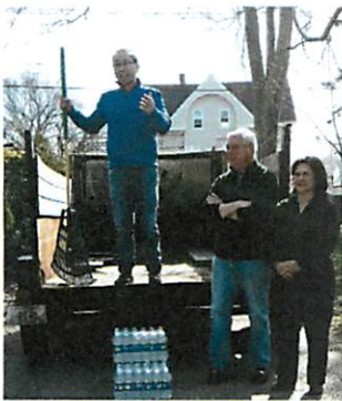
CHCC sponsored April 14 Cemetery Awareness Day Mayor Fung, Warwick Mayor Avedisian and Secty of State Gorbea