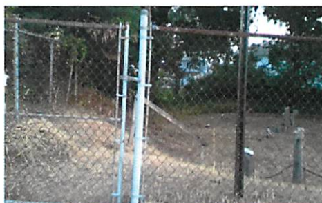
After incl. probing/finding righting stones