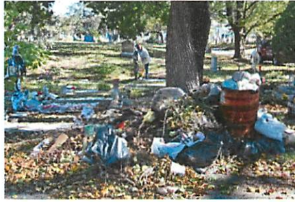
Oakland in dire need of cleaning, clearing fallen trees – It is in disarray since we volunteered April 14.