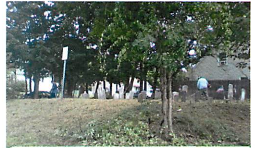
Clean & cleared, some stones need righting; needs spraying for poison ivy