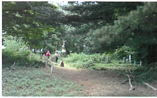
After clearing incl. poison ivy. Will need spraying for poison ivy to get back in to clean/clear