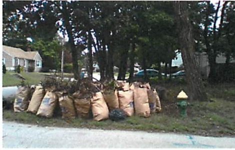
Cut up felled tree, 50 bags / After clearing incl. poison ivy