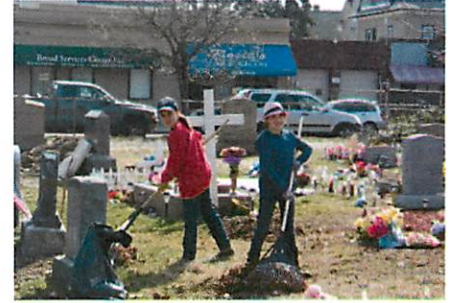
Volunteers on April 14